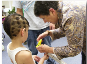
During the Summer Reading Program, children learned to make their own didgeridoo.