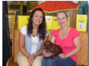
Patrons brought their dogs to the library for "Dog Days of Summer."

120 programs at the library during 2010.