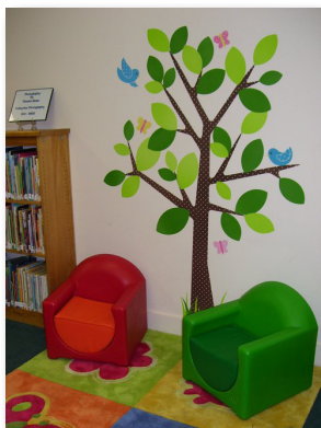
Furniture and wall art was purchased for the kids area with a grant from the Friends of the Tompkins County Public Library.

The One Card, One County program was launched in February 2011. Patrons need only one card to access the collections and resources of the six libraries in Tompkins County.