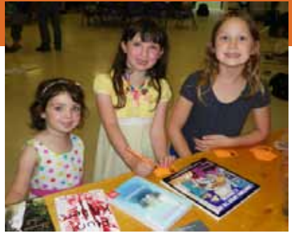
Three young readers at a Library program

The Newfield Public Library is your open door to the world. We offer you access to computers and free wi-fi, DVDs, e-readers, audiobooks, and books for all ages. You can travel anywhere from within the walls of your local community library.