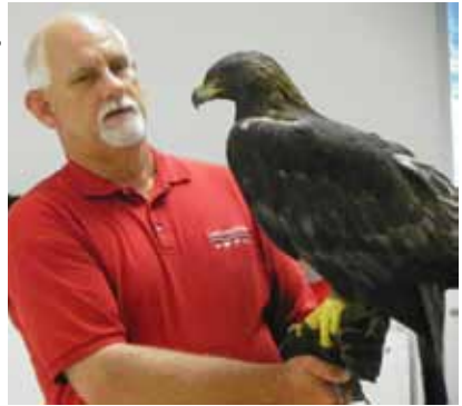
Two popular visitors from Cornell's Raptor Center