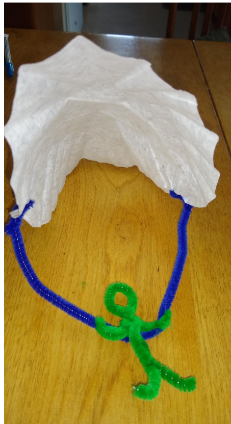
Jayne P.'s Parachute Person clocked an impressive 5 second float from a 10 foot drop.

Keep up the great work! Remember, all reading counts!