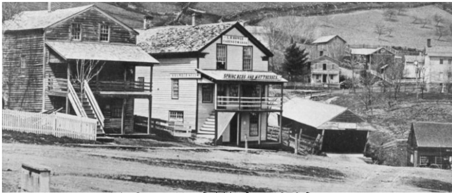
Main Street, Newfield before 1870 fire.

Join us for an open house at the NEW "Newfield History and Activity Center"! The event will be held on two dates: Monday, March 15 and Saturday, March 20. Stop by between 10:00 am and 2:00 pm for a tour and enjoy an exhibit of Newfield's history presented by the Newfield Historical Society. Visit the Newfield Public Library at the same time to see some exciting changes made possible by this project. Wearing a mask and maintaining a social distance is required. See you there!